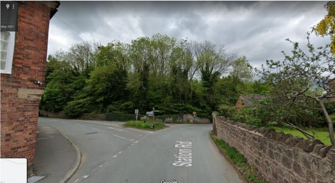
PS6 (Note restricted forward visibility opposite mini-island)