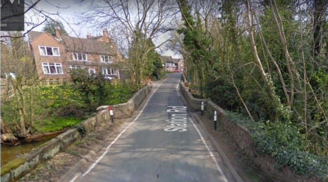
P1 (Note width restriction of listed Condover Bridge)