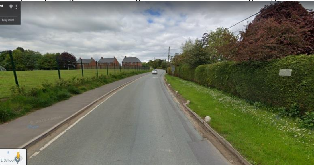
P11 (Note informal protection to prevent verge erosion)