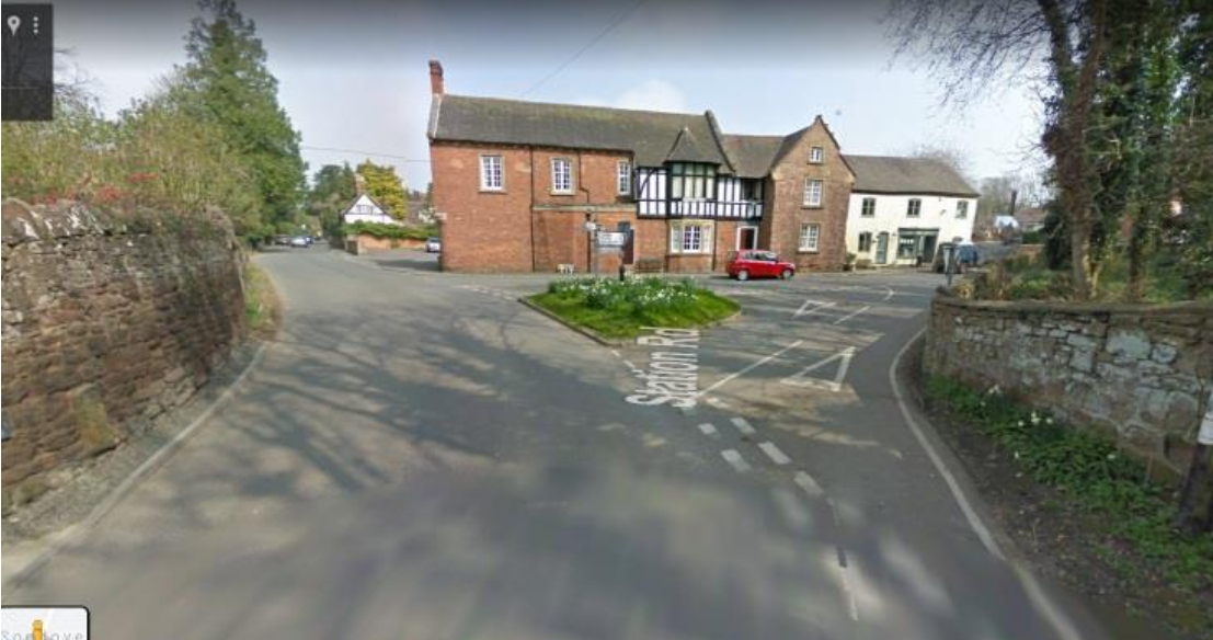
P2 (Note no evidence of damage to stone wall at this pinch point)