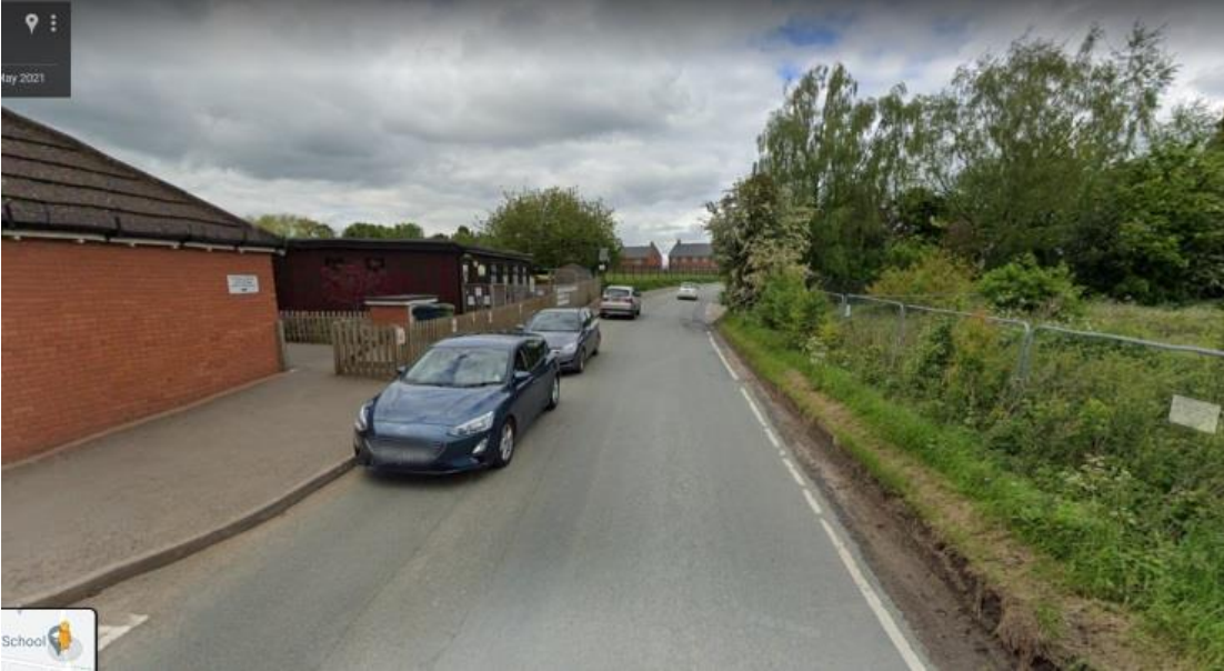
P10 (Note parking outside of designated areas restricts carriageway)