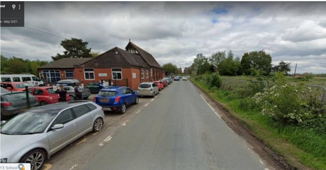
P9 (Note evidence of verge erosion opposite school)