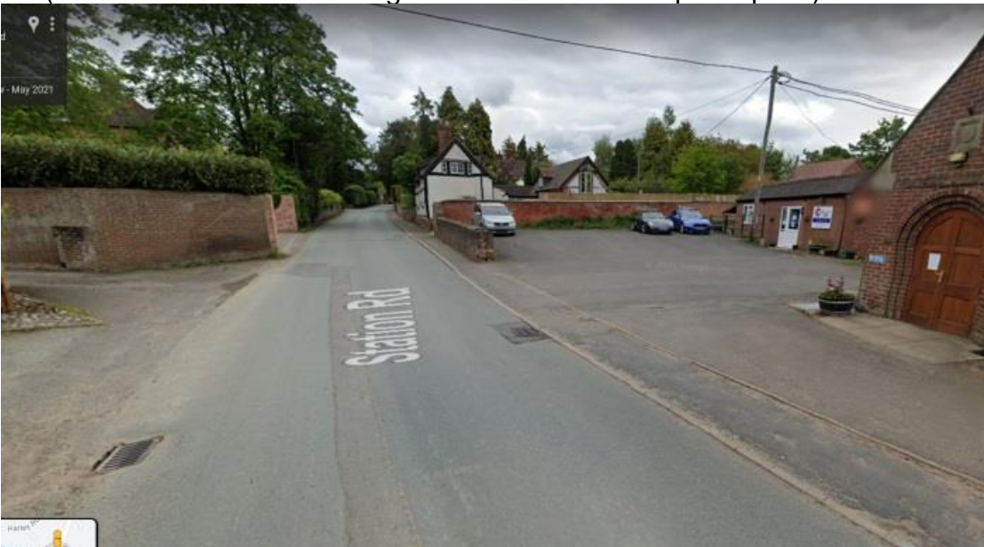
P3 (Note Grade II listed timber framed Rose Cottage in middle of picture)